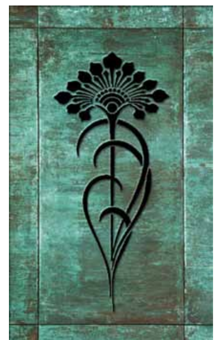
Opposite: a large gate designed by Kate greets visitors to Silent Rock. Above: three digital mock-ups by Kate showing design and materials. Both pages: design sketches.